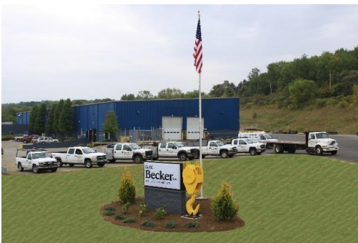
Production Facility 2600 Kirila Blvd., Hermitage, PA