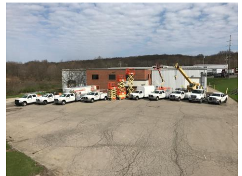
Sales and Service Facility 1565 Broadway Rd., Hermitage, PA