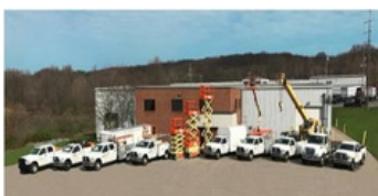
Sales & Service Facility 1565 Broadway Rd. Hermitage, PA

To become an extension of our customers' management team in the area of Cranes/ Overhead Material Handling Systems, providing premium products and quality service.